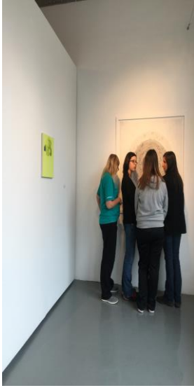
Belle High School students on a tour at the Art Center