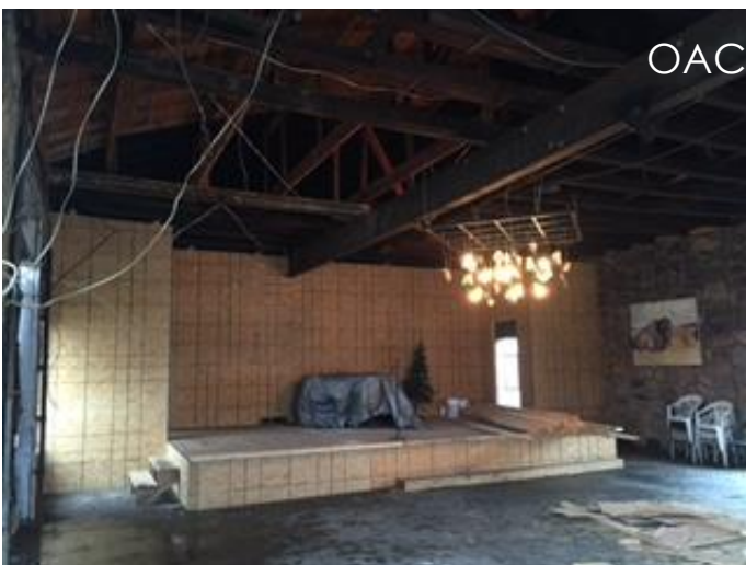
OAC Warehouse Stage

2016 Renovation budget for current projects Total = $100,000