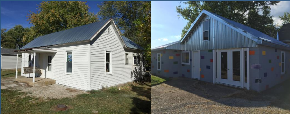
Studio #105 & Studio #100 Renovations are complete