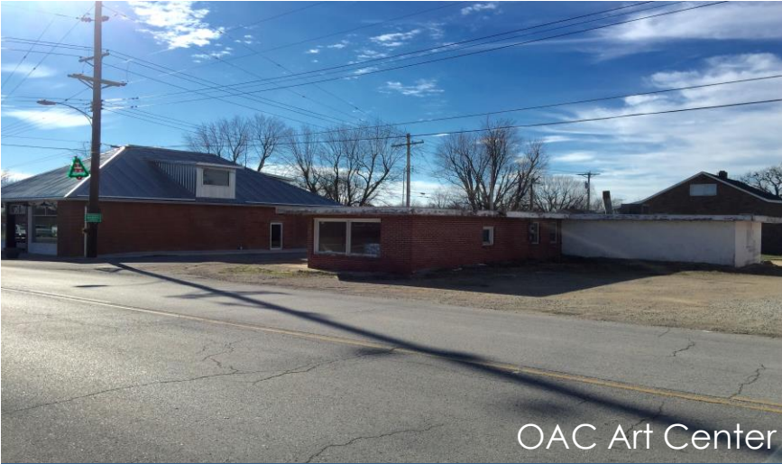
OAC Art Center Annex