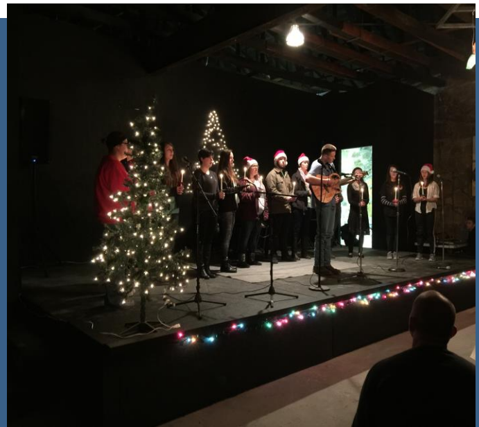
OAC YMP Christmas Concert @ the Warehouse

Belle Beautification Project – 15 Flower containers and flowers on Main Street